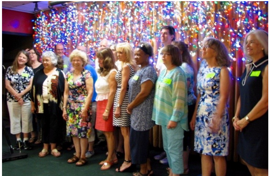
24 Newly-retired teachers take the spotlight

On Tuesday, September 15, twenty-four newly-retired Minneapolis Public Schools teachers attended their first MRTI luncheon - a joyous celebration of their many years of service to Minneapolis Public Schools. Part of a class of 93 retirees, our guests introduced themselves, giving their names, the schools from which they retired and the number of years they had taught, which ranged from 19 - 39 years!